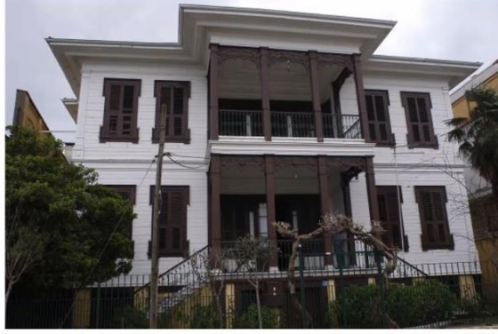
Alalemcıyan Köşkü, Büyükdada